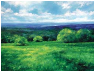
"Valley View" by Linda Puiatti Oil on canvas 2004; 36: x 48

Founded in 1964, the Dutchess County Arts Council is a not-for-profit arts service organization dedicated to strengthening and supporting artists and arts organizations in Dutchess County and the Mid-Hudson region; enhancing the quality of life through the arts; and integrating the arts and artists into every segment of the community through a variety of promotion, education and outreach programs. We are recognized by the New York State Council on the Arts as a Primary Institution in the cultural life of the state. The projects and organizations we support reach in excess of 300,000 people including more than 150,000 youth, each year!